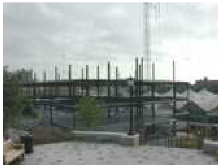
View from new Higgins Stairs toward Flynn RecPlex