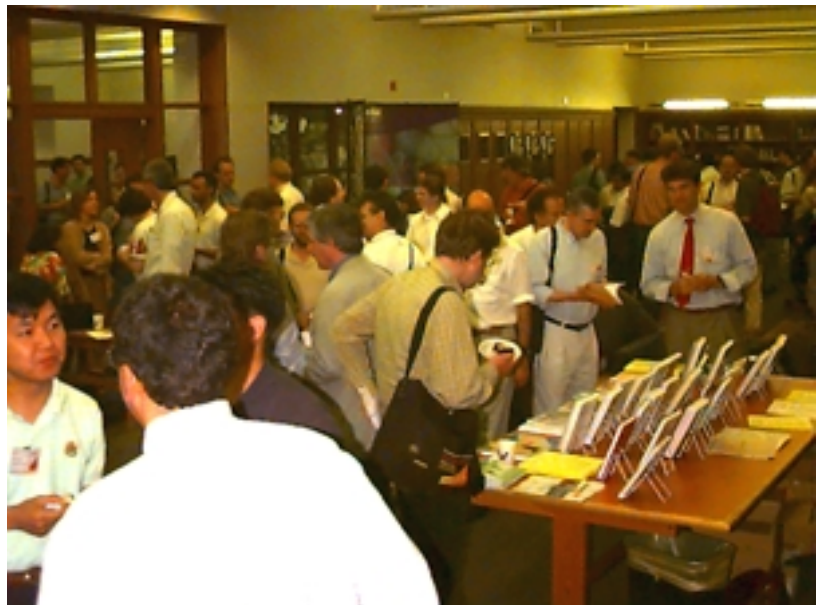
Conference participants enjoy the exhibitors' display